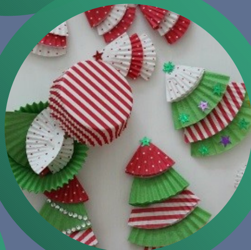
Cupcake case trees