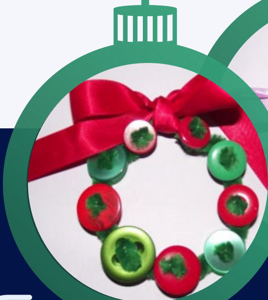
Button Christmas Wreaths

Make a large, loose loop on one end of the pipe cleaner so that the buttons don't fall off while you are working. Thread the pipe cleaner in and out through each button, spacing the buttons as you go. Bend into a circle, then twist the top of the circle together to secure the buttons in place. Tie a ribbon or bow around the top on the wreath.