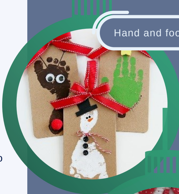
Hand and footprint crafts

The children are in full cheer and in the Christmas spirit. We are looking forward to our Christmas shows next week. In class, we have been creating wonderful festive crafts and decorations and all the classrooms are looking enchanting. You may like to try some more craft activities over the holidays.