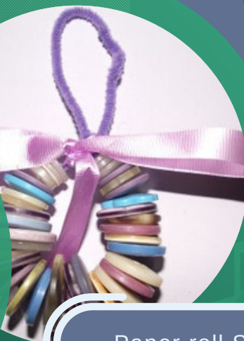
Paper roll Snowman

Make a large, loose loop on one end of the pipe cleaner so that the buttons don't fall off while you are working. Thread the pipe cleaner in and out through each button, spacing the buttons as you go. Bend into a circle, then twist the top of the circle together to secure the buttons in place. Tie a ribbon or bow around the top on the wreath.