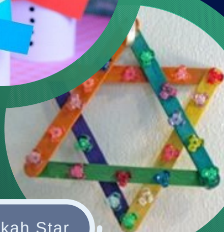
Lolly Stick Hanukkah Star