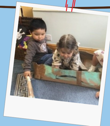
Inside Class 1 this week